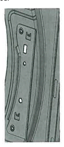
Figure 3. The previous hinge support sheet design (welded to the panel)