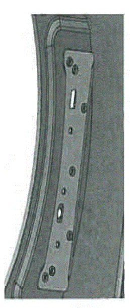
Figure 3. The previous hinge support sheet design (welded to the panel)

The thickness is increased from 1mm to 2mm in the areas mentioned.